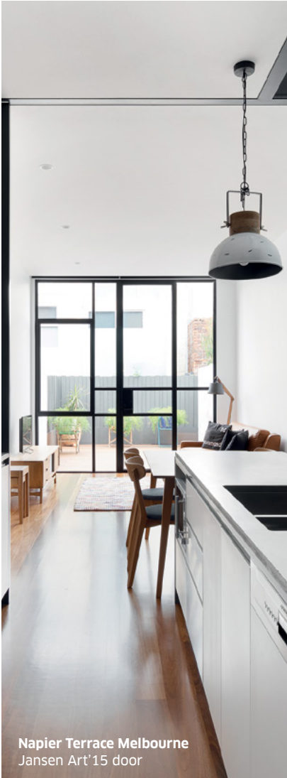
Napier Terrace Melbourne Jansen Art'15 door

Steel system strength enables smaller frames that can bear larger spans of glass, offering more views with less profile.