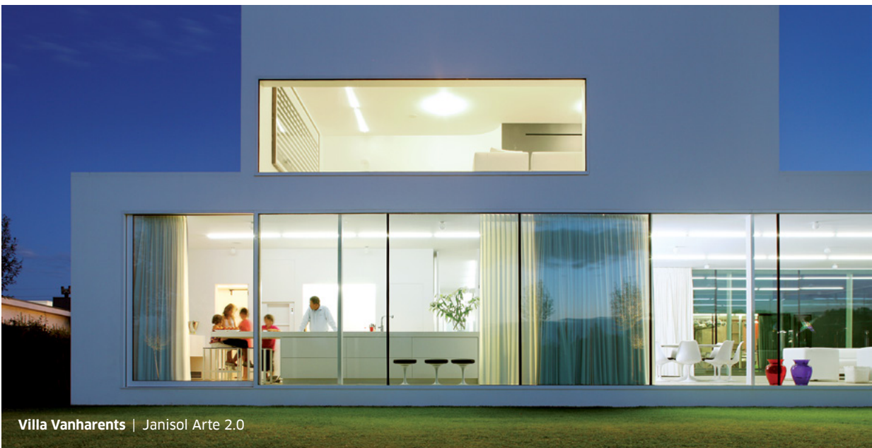
Villa Vanharents | Janisol Arte 2.0