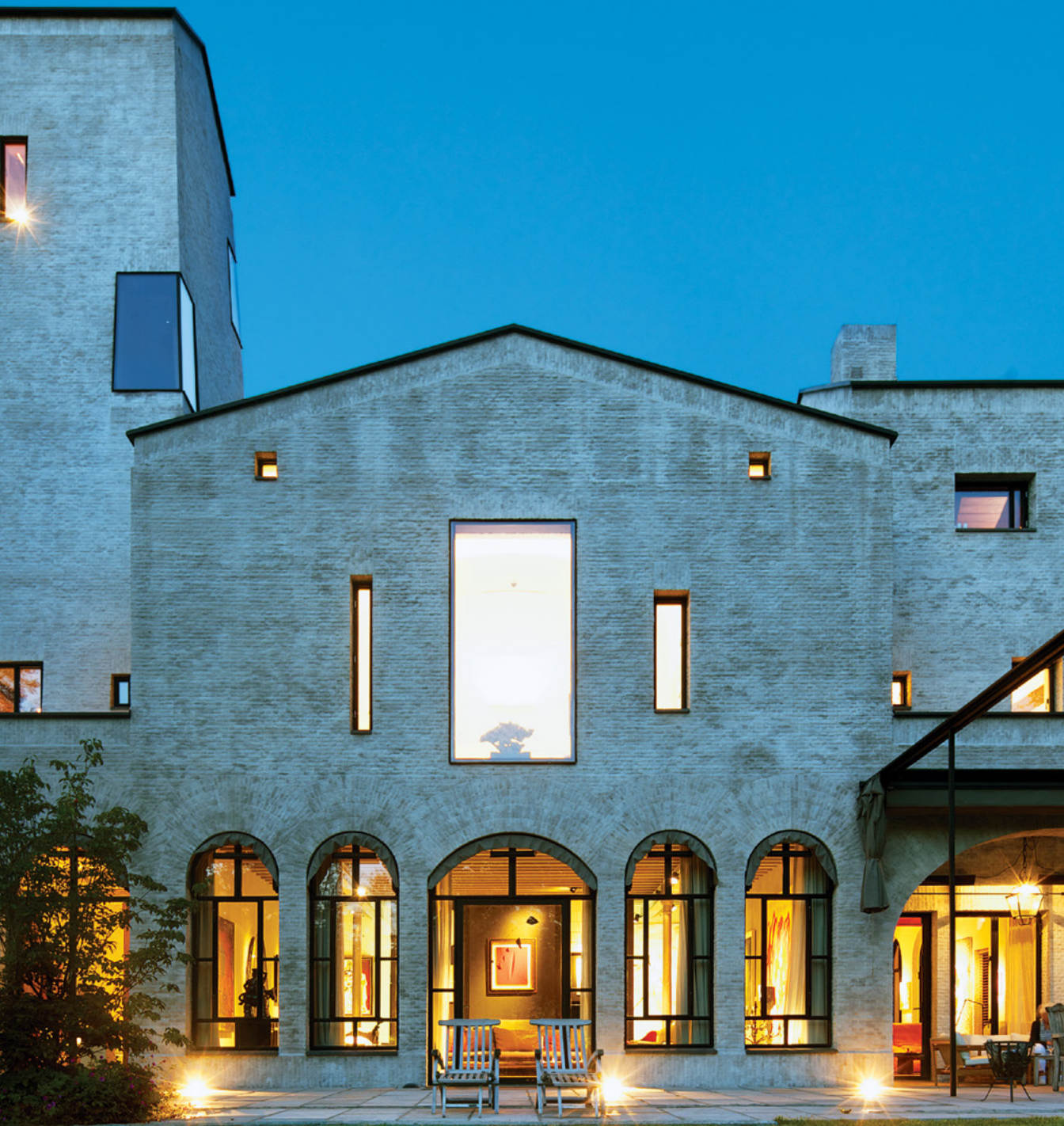
Manor House (Landhuis) Wassenaar | Janisol Arte 2.0 window, VISS Roof Glazing